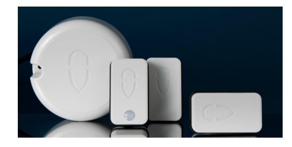
VirCru is your virtual crew – always onboard and always connected to you.